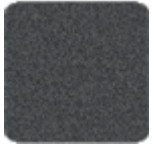
PMG RAL 7016