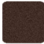
PUM RAL 8017