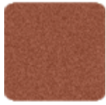
PMG RR 750