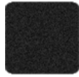
PMG RR 033