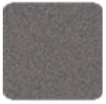
PMG RR 023