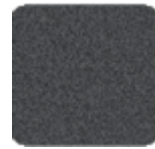
PUM RAL 7016