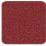
PMG RR 028