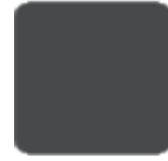
PUR RAL 7016