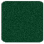
PMG RR 011