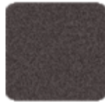
PMG RR 032